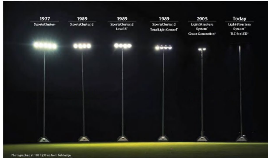
Fixture Shielding and Glare Control Athletic Facilities Lighting Impact Study

The football stadium lighting does not use the same technology that will be installed at the soccer stadium. The illustration below from the presentation on July 28, 2020 shows how the soccer lights will be focused within the perimeter of the field with minimal light spillage.